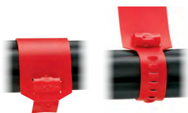
Wrap-Around Marker (Min. Dia.: 1.27") Flag Marker (Min. Dia.: .25")